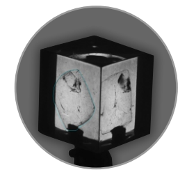
6 Axis – Completely Motorized Microscopic - 3D Automatic Inclusion Plotting System